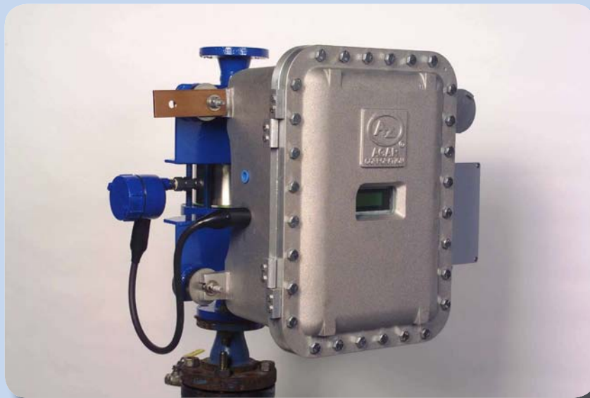
OW 201 Series